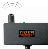
Wireless Rechargeable Battery Powered Transceiver