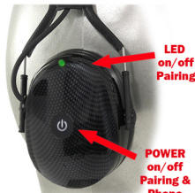
Wireless Bluetooth Over-the-Head Style w/ Internal Antenna