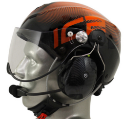
Icaro Solar X Helmet with Wireless Helmet Mounted Headset & Internal Antenna