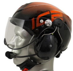
Helmet Mounted Headset