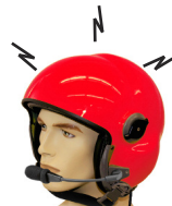
MSA Helmet with Wireless Belt Station