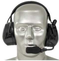
Wireless Bluetooth Headset with External Antenna