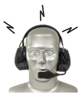
Wireless Bluetooth Over-the-Head Style w/ Internal Antenna