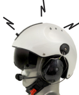
Icaro Helmet with Helmet Mounted Wireless Headset