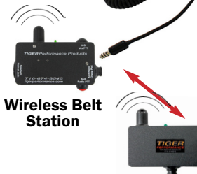
Wireless Belt Station