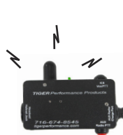
Wireless Belt Station