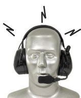
Wireless Bluetooth Over-the-Head Style w/ External Antenna