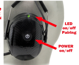
Wireless Bluetooth Over-the-Head Style w/ Internal Antenna