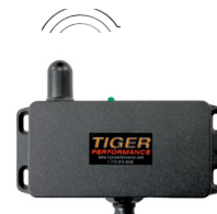
7-24 Volt Transceiver