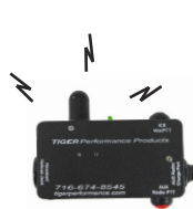
Wireless Belt Station