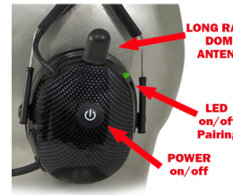
Wireless Bluetooth Over-the-Head Style w/ External Antenna