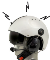
Icaro Helmet with Helmet Mounted Wireless Headset