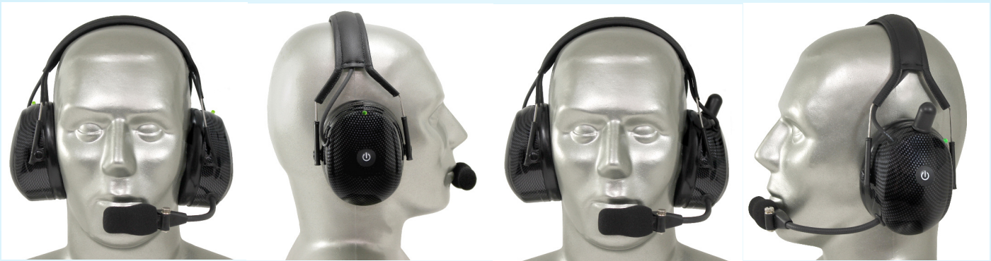
Wireless Bluetooth Over-the-Head Style w/ Internal Antenna