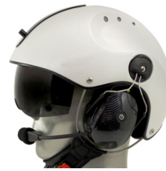
Icaro Rega II Helmet with Wireless Bluetooth Helmet Mounted Headset & Internal Antenna