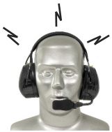
Wireless Bluetooth Over-the-Head Style w/ Internal Antenna