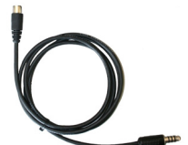
Transceiver Cable with U174 plug