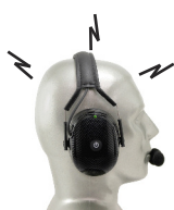
Wireless Bluetooth Over-the-Head Style w/ Internal Antenna