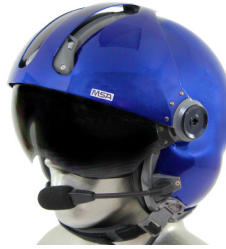
MSA Helmet with Wireless Belt Station