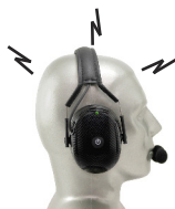
Wireless Bluetooth Over-the-Head Style w/ Internal Antenna