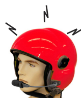
MSA Helmet with Wireless Belt Station