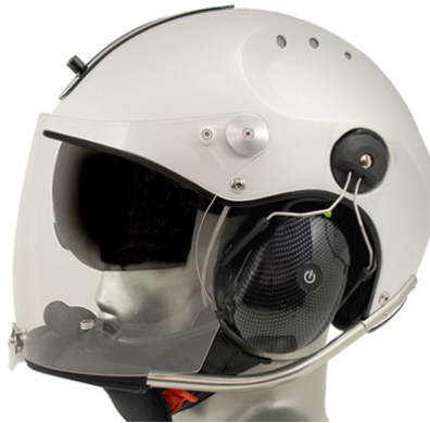
Pearl White Rollbar Plus Helmet with PNR Bluetooth Wireless Rechargeable Battery Headset