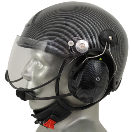
Carbon Fibre TZ Helmet with PNR Bluetooth Wireless Rechargeable Battery Headset