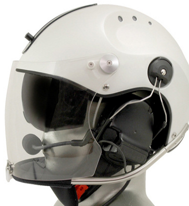
Pearl White Rollbar Plus Helmet with PNR Comtac III Tactical Hear Thru Headset