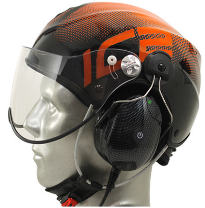
Black/Orange Solar X Helmet with PNR Bluetooth Rechargeable Battery Headset