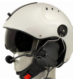
Pearl White Rega II Helmet with PNR Comtac III Tactical Hear Thru Headset