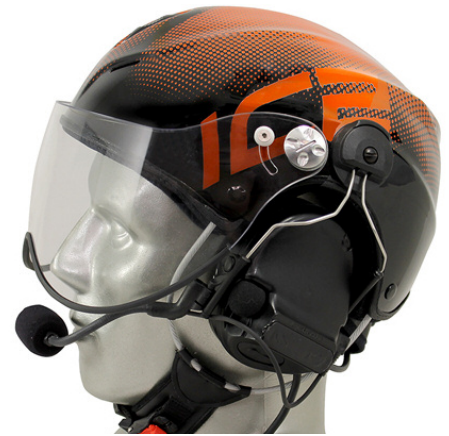
Black/Orange Solar X Helmet with PNR Comtac III Tactical Hear Thru Headset