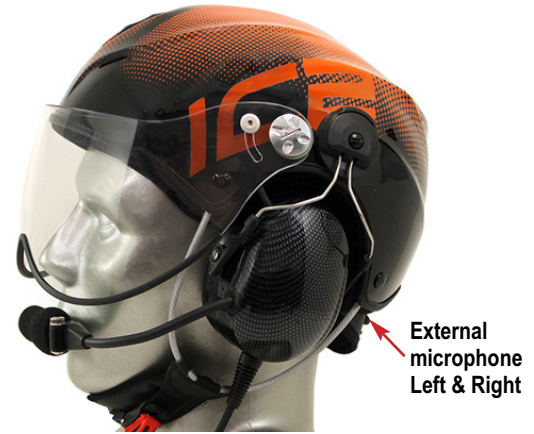
Black/Orange Solar X Helmet with ANR Tactical Hear Thru Headset