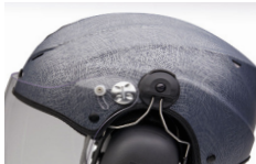
Scratch Grey Limited Editions

Custom Colors are available (special order)