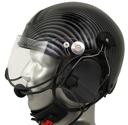
Carbon Fibre TZ Helmet with PNR Comtac III Tactical Hear Thru Headset