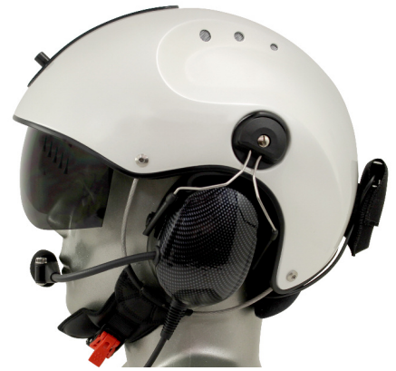
Pearl White Rega II Helmet with ANR 9 Volt Battery Powered Headset