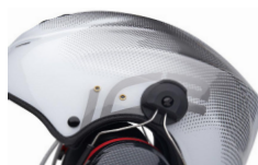
Gloss Black/White Digital