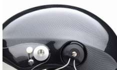
Gloss Black Carbon Fibre