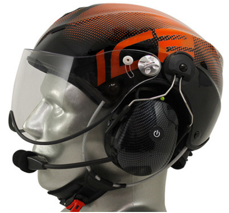
Black/Orange Solar X Helmet with PNR Wireless Rechargeable Battery Headset