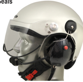
Pearl White Scarab Helmet with PNR Portable Radio Headset