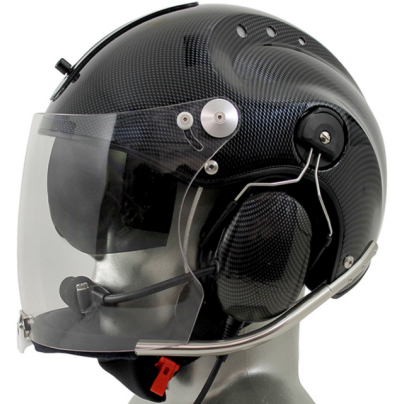
Carbon Fibre Rollbar Plus Helmet with PNR Headset