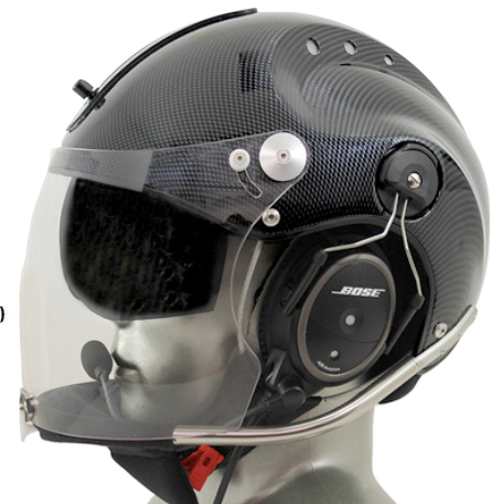
Carbon Fibre Rollbar Plus Helmet with ANR BOSE A20 Bluetooth Headset