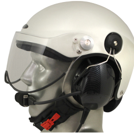
Pearl White Scarab Helmet with ANR Aircraft Powered Headset