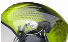
Gloss Black/Green Digital