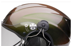
Deep Forest Digital Limited Editions