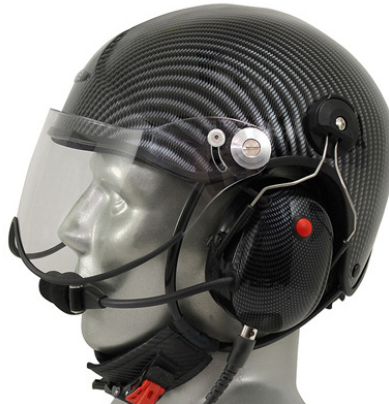
Carbon Fibre TZ Helmet with PNR Portable Radio Rechargeable Headset