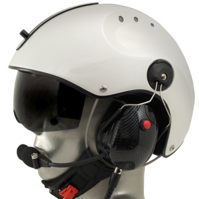
Pearl White Rega II Helmet with PNR Portable Radio Rechargeable Headset