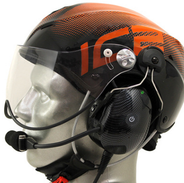
Black/Orange Solar X Helmet with ANR Rechargeable Battery Powered Headset