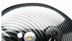
Gloss Black Carbon Fibre