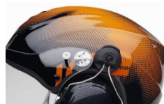
Gloss Black/Orange Digital