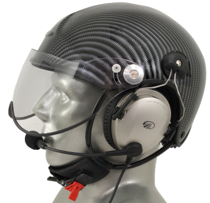
Carbon Fibre TZ Helmet with ANR Lightspeed ZULU 3 Headset

Battery Power Supply: 3V, two AA Batteries Panel aircraft 8-40 VDC Headphone: Transducer: 40mm moving coil Frequency response: 20 Hz-20 kHz Nominal impedance @ 1 kHz: OFF Mono: 200 ohms ON Mono: 280 ohms OFF Stereo: 400 ohms ON Stereo: 560 ohms ANR - Maximum SPL: Greater than 125