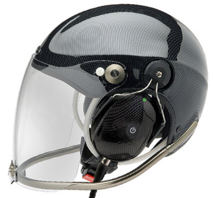
Carbon Fibre Rollbar Helmet with ANR Bluetooth Rechargeable Battery Headset