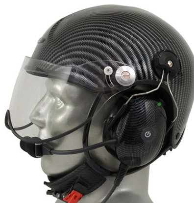
Carbon Fibre TZ Helmet with ANR Bluetooth Rechargeable Battery Headset