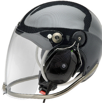
Carbon Fibre Rollbar Helmet with PNR Bluetooth Rechargeable Battery Headset