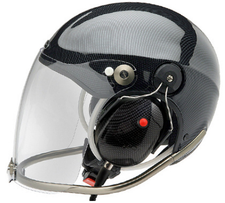
Carbon Fibre Rollbar Helmet with PNR Portable Radio Headset