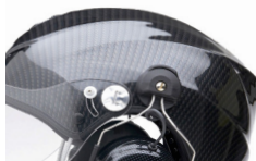
Gloss Black Carbon Fibre