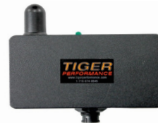
Shown: Bluetooth Wireless Rechargeable Battery Powered Transceiver

Wireless Transceivers are available in high or low impedance, 7-24 volt or Lithium Ion Battery Powered. Cables are available in 2', 5', 10', & 15' lengths